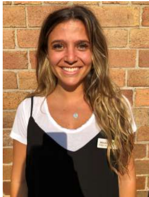
Assistant Director Full time