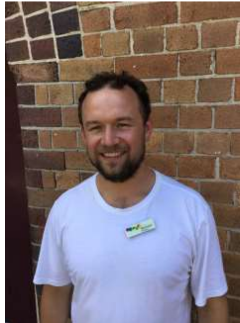
Senior Educator Permanent Part Time