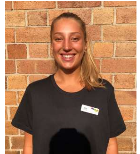
Senior Educator Permanent Part Time