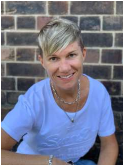
Director Nominated Supervisor Education Leader Full time